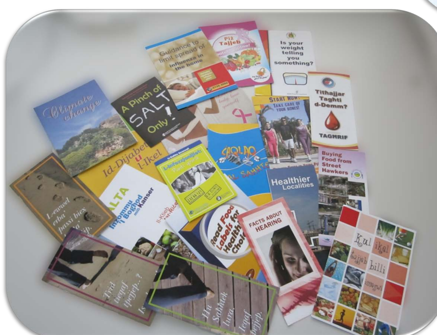
Package of health promotion material given to the participants