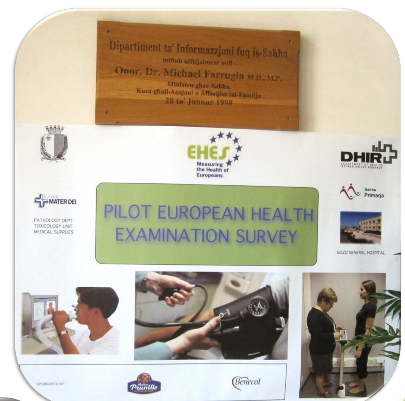
Poster about the survey