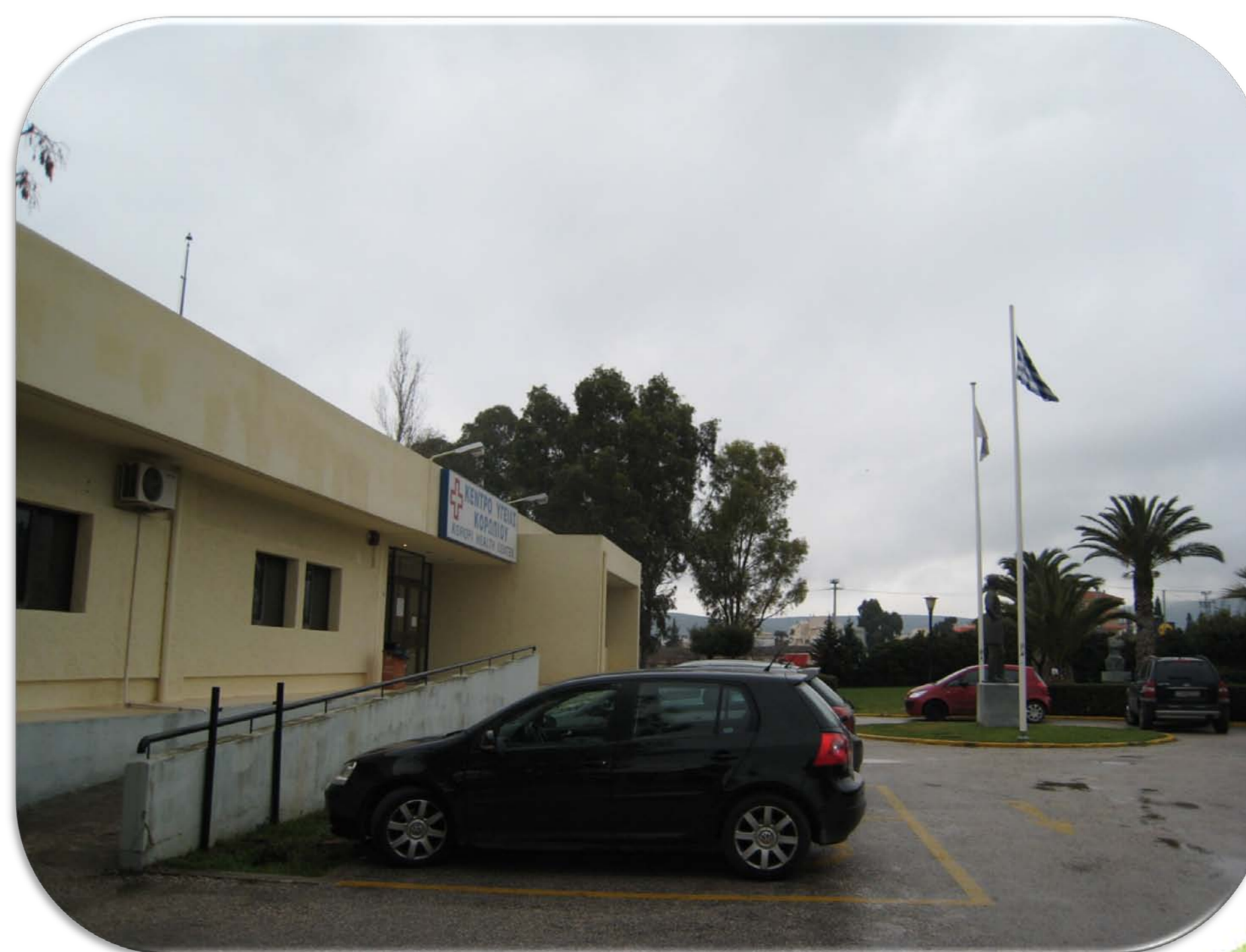
Health centre in Koropi