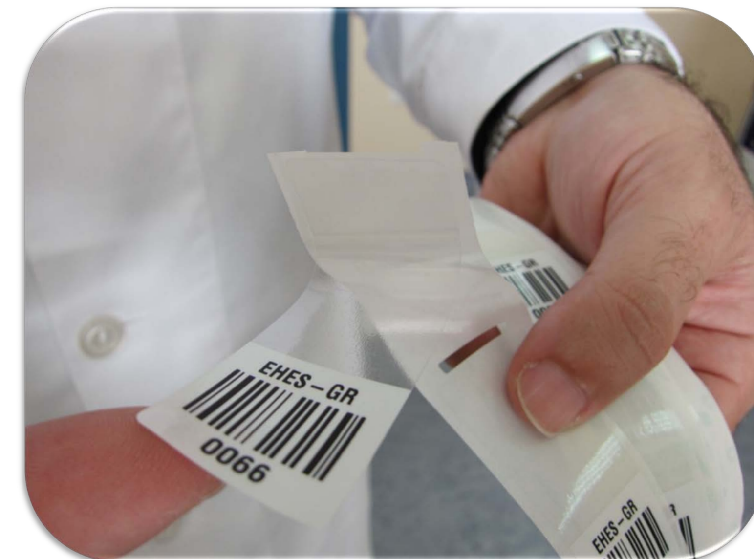
Identification stickers for blood tubes. Transparent ending on stickers secures placement on tubes.