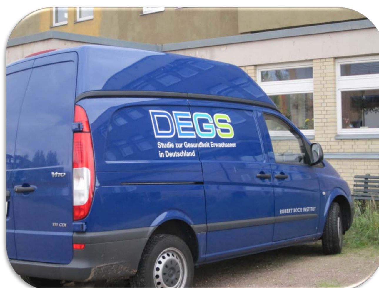
Survey teams travels around Germany with DEGS car